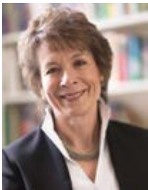
Professor Lesley Regan MD DSc FACOG PRCOG President

Don't delay in booking your place, the Congress has sold out over the last 4 years.