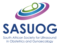
South African Society for Ultrasound in Obstetrics and Gynaecology (SASUOG)